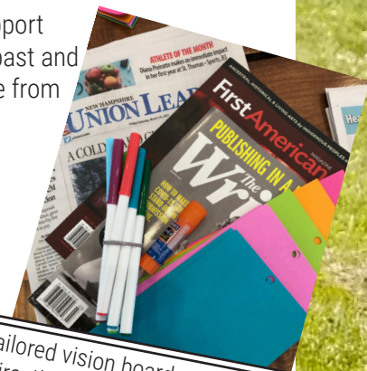
Tailored vision board packages mailed directly to each Avenue A participant reflecting their individual interests.

In one of the last sessions, participants were asked to set a formal goal using FFI's preferred goal setting method of objectives, key results, and action steps (OKR's). One of the young people, Maggie, stated that this method, "broke down big picture goals to make them more attainable." No matter what method worked best for them, each participant came away with at least one important future goal. One participant said they wanted to start to write one poem a day, some shared, they wanted to get outside more, and most mentioned they felt better prepared in their decision to select a future university to attend.